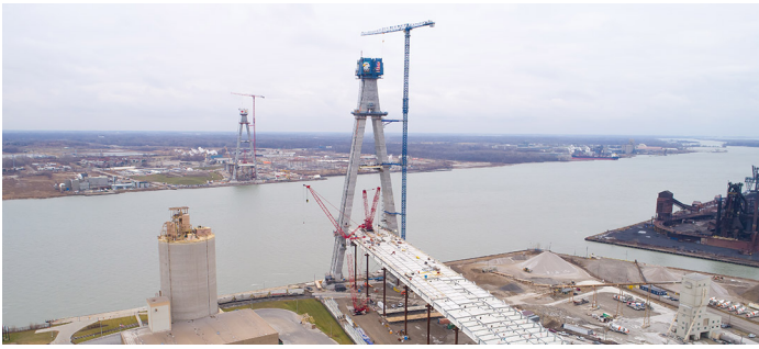
Gordie Howe International Bridge construction