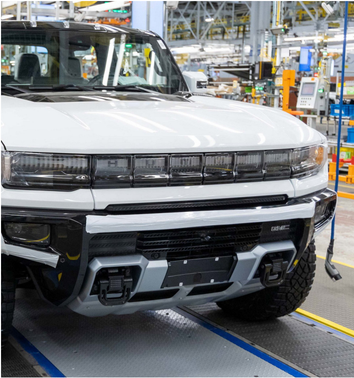
Magna's electric Hummer assembly line.